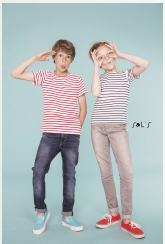
MILES KIDS 01400