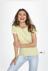
MILES WOMEN 01399