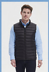
SOL'S WILSON BW MEN 02889