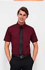
SOL'S BROADWAY 17030