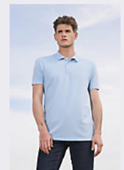
SOL'S SUMMER II 11342