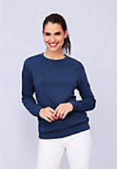
SOL'S SULLY WOMEN 03104