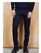
NEOBLU GASPARD MEN 03180